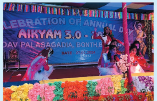
OAV, Palasagadia, Bonth, Bhadrak celebrated its Annual Day -AIKYAM 3.0

A blood donation camp was organized in our school with the collaboration of sambad "AMA ODISHA" and ASPIRE. In this camp, the principal and the teachers of our school donated blood and 66 units of blood were collected through this program. Finally, The Chief Medical Officer of Harichandanpur primary Health Centre informed all the students about the importance of blood donation.