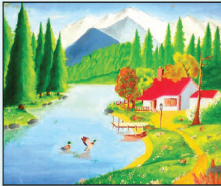
BEDANJALI BEHERA, CLASS-IX OAV SATRUSOLA, GANJAM