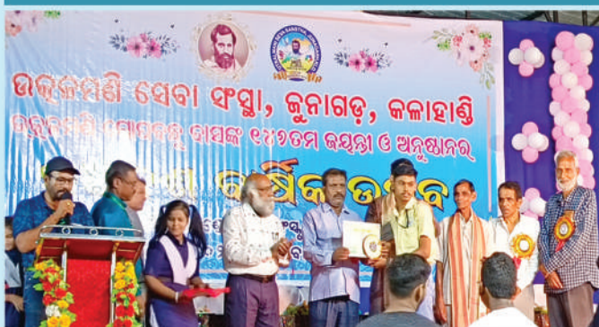
Student of OAV Junagarh, Kalahandi were felicitated in foundation day at Utkala Mani Seva Sanstha on the occasion of 146th Birth Anniversary of Utkala Mani Gopabandhu Das.